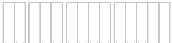
Two, three, four and five-chamber combinations

E.g. if 10 chamber lanes are required, these can be made up of two 5-chamber combinations or two 4-chamber combinations and one 2-chamber combination. The number of storage spaces can be planned individually and easily expanded.