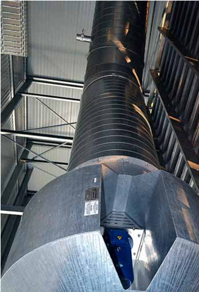
Air circulation systems create the right conditions for constant temperature and humidity distribution inside the curing chamber. Optional: with active temperature and humidity control.