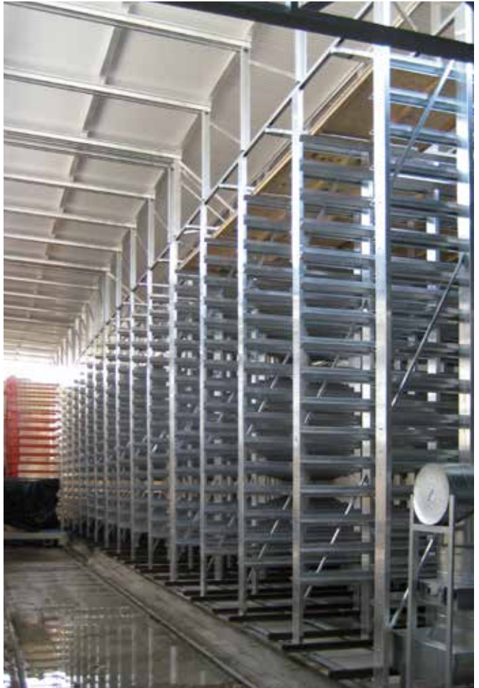
Secure storage and removal from storage by the finger car – the high lateral bead of the pallet support, with its continuous lateral guide, prevents collisions with the aluminium posts.