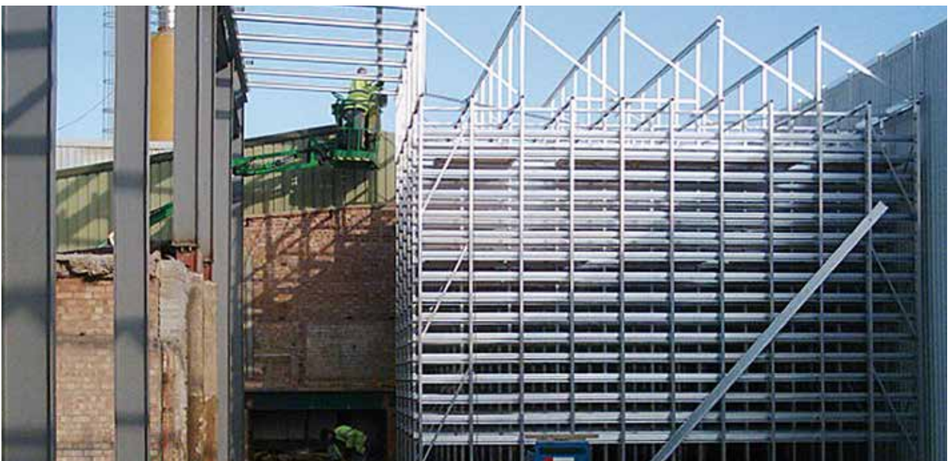
Curing chambers by HS Anlagentechnik are distinguished by their extremely high dimensional and fitting accuracies, parallelism and stability.